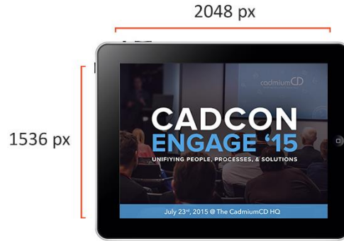
Full Splash Screen Horizontal Orientation

Please provide mobile app graphics in .psd and .png file formats.